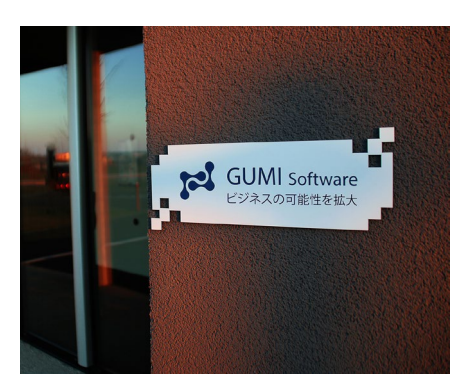
POP displays and sign engraving