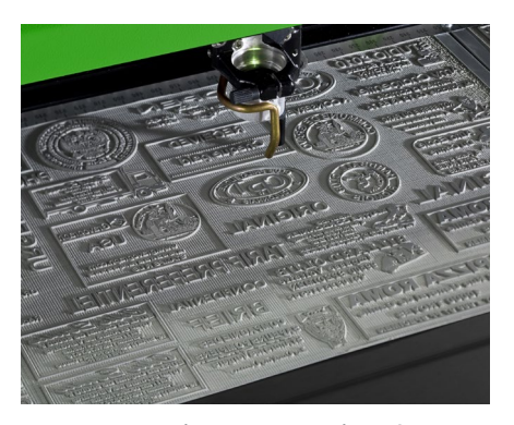
Engraving & laser cutting of custom ink stamps